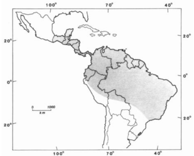
FIG. 3. Geographic distribution of Lonchorhina aurita .

The tail, composed of eight vertebra, is longer than the femur, and reaches to the posterior tip of the uropatagium (Solmsen, 1985). The wings extend to the distal end of the tibia, are sparsely furred dorsally (humerus and forearm only), and lightly furred ventrally near the body. The foot is about two-thirds the length of the tibia, and shorter than the calcar.