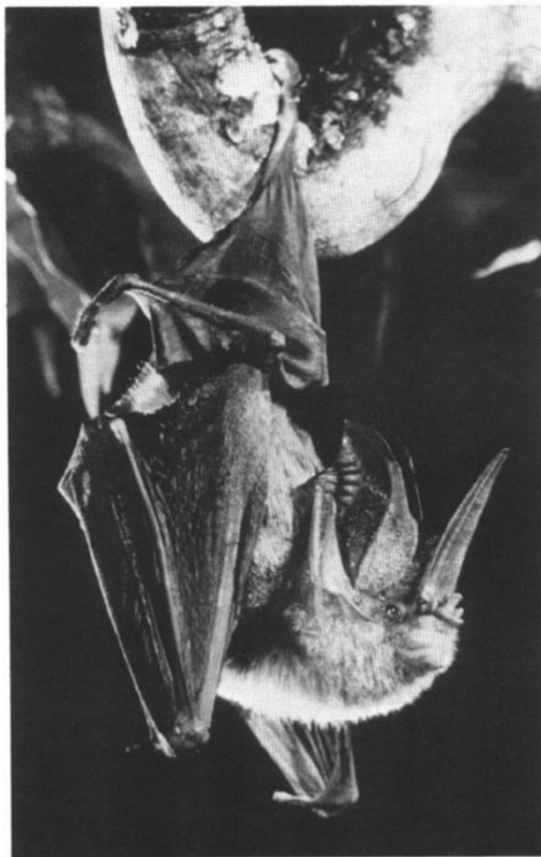
FIG. 1. Photograph of Lonchorhina aurita from Panama.

The nose leaf is lance-shaped, with a prominent longitudinal