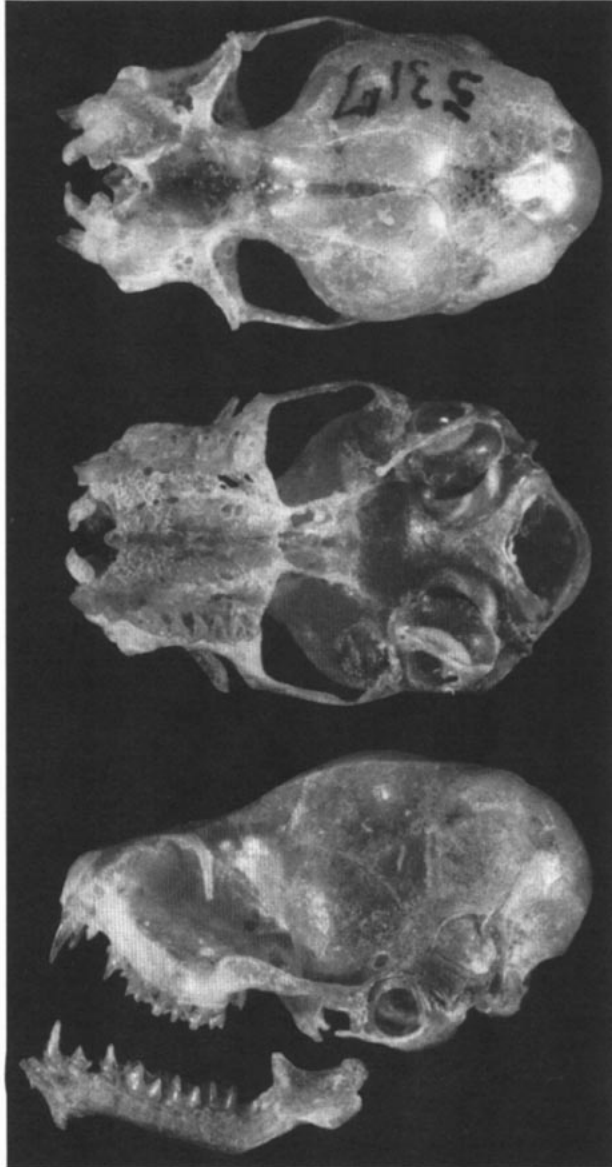
FIG. 2. Dorsal, ventral, and lateral views of cranium, and lateral view of lower jaw of Rhynchonycteris naso from Trinidad (male, Texas Tech University 5317). Greatest length of skull is 11.8 mm.

Based on two specimens from Nicaragua, measurements of the stomach (mm) are: greatest length, 7.4–8.1; greatest breadth, 3.1–3.8; gastroesophageal junction to pyloric sphincter, 2.4–2.9; gastroesophageal junction to apex of fundic caecum, 2.5–2.8; breadth of pylorus at sphincter, 1.3–1.4 (Forman, 1972). The stomach is tubular, reniform, tapering from fundic caecum to pylorus; terminal endpiece lateral to the pyloric curvature is relatively long (2.5 mm). A cardiac vestibule is present, although short and narrow; the zone of incisura cardiaca is relatively deep and narrow, with no apparent separation of circular fibers into laminated sheets at incisura; the fundic caecum is well developed, dilated, expanded superiorly, and with the surface rounded throughout, and is structurally continuous with the midstomach. The pyloric sphincter is long and narrow. The musculature is generally thin throughout much of the stomach wall, but is thickened locally. Rugal folds are numerous and glands of Bruner are moderately abundant. The mucosal lining is reduced throughout much of the fundic caecum and greater curvature. The stomach conforms in most features and in general configuration to those of other obligate insectivorous bats; the fundus is variable in structure (Forman, 1972). R. naso has six Peyer's patches in the small intestine (Forman, 1974), covering an average of 6.5 mm 2 ( n = 2 ).