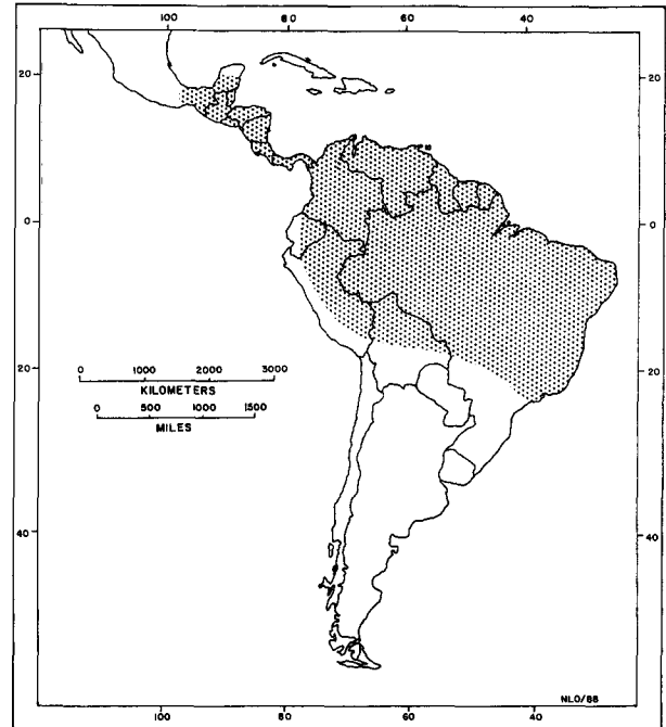
FIG. 3. Geographic distribution of Rhynchonycteris naso (after Hall, 1981, and Koopman, 1982).

Based on two specimens from Nicaragua, measurements of the stomach (mm) are: greatest length, 7.4–8.1; greatest breadth, 3.1–3.8; gastroesophageal junction to pyloric sphincter, 2.4–2.9; gastroesophageal junction to apex of fundic caecum, 2.5–2.8; breadth of pylorus at sphincter, 1.3–1.4 (Forman, 1972). The stomach is tubular, reniform, tapering from fundic caecum to pylorus; terminal endpiece lateral to the pyloric curvature is relatively long (2.5 mm). A cardiac vestibule is present, although short and narrow; the zone of incisura cardiaca is relatively deep and narrow, with no apparent separation of circular fibers into laminated sheets at incisura; the fundic caecum is well developed, dilated, expanded superiorly, and with the surface rounded throughout, and is structurally continuous with the midstomach. The pyloric sphincter is long and narrow. The musculature is generally thin throughout much of the stomach wall, but is thickened locally. Rugal folds are numerous and glands of Bruner are moderately abundant. The mucosal lining is reduced throughout much of the fundic caecum and greater curvature. The stomach conforms in most features and in general configuration to those of other obligate insectivorous bats; the fundus is variable in structure (Forman, 1972). R. naso has six Peyer's patches in the small intestine (Forman, 1974), covering an average of 6.5 mm 2 ( n = 2 ).